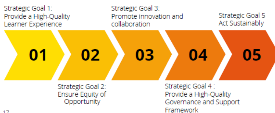
Figure 4 - the 2022-26 strategic goals