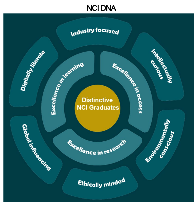
Strategic Themes and Goals 2019 - 2024

These attributes of the NCI graduate are aligned with the College's vision, mission and values, and form the foundation of the academic strategy 2019 - 2024.